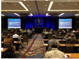
ASAM's State of the Art Course