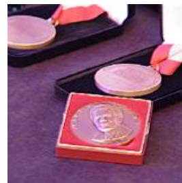
Ruth Fox Medallion