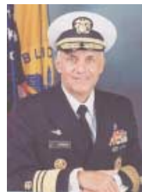
Surgeon General Richard Carmona, M.D., M.P.H.

National attention to the problem of youth alcohol use picked up momentum last month as Surgeon General Richard Carmona, M.D., M.P.H., officially announced his intention to issue a Call to Action on underage drinking.