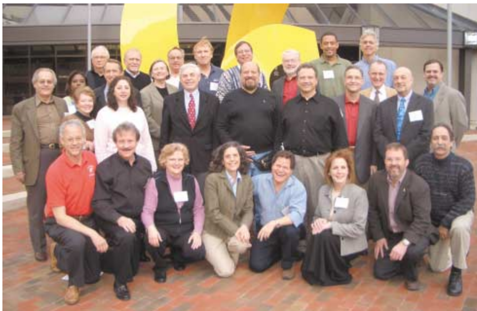
Members of the SMSS program and the Chapters Council met with ASAM's elected leadership January 20-21st in Bethesda, Maryland. Pictured are: