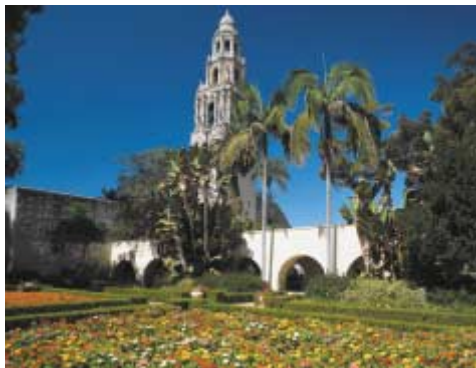
Balboa Park in San Diego