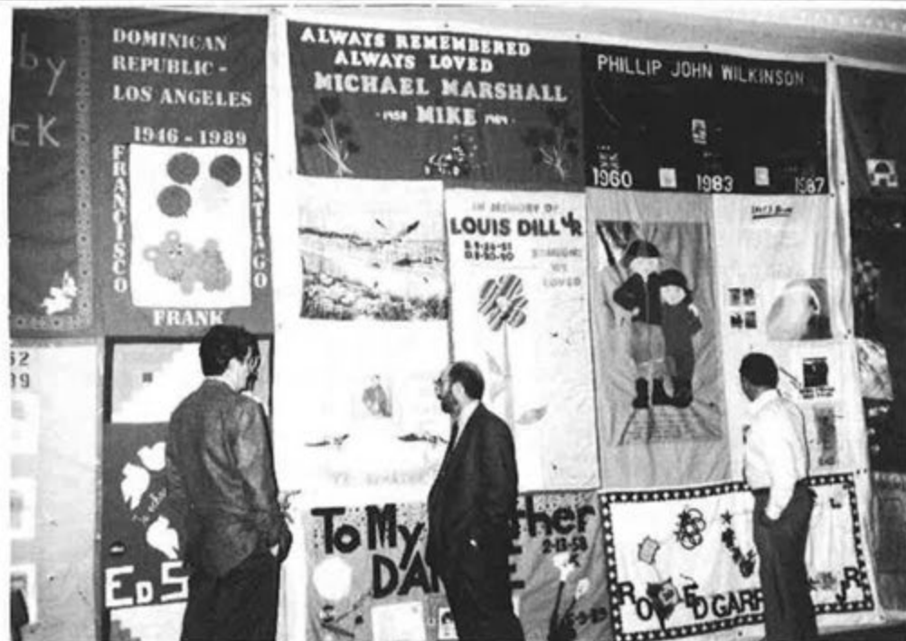
The AIDS Memorial Quilt at the conference

The T-4's rose from an average of 360 to 690. When Tagamet was stopped, the T-4's declined to their pretreatment levels. When the patients were put back on Tagamet, the T-4's